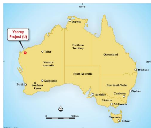
Figure 1: Major Project Locations in Australia

Further field work at Bennet Well is on hold until clarity on Western Australian uranium exploration policy is received from the Minister of Mines and Petroleum.